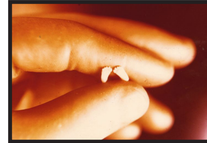
Pre-born baby's feet at 10 weeks

The Bible teaches us that GOD IS THE SOURCE OF ALL LIFE.